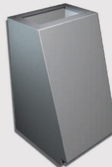
Medium console base