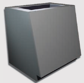
Large console base